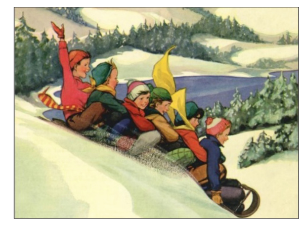
"Winter must be cold for those with no warm memories." -An Affair to Remember

For more recipes and seasonal ideas, check out our Sunday Dinners post, at sweetie-licious.com.